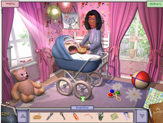
Do little favors