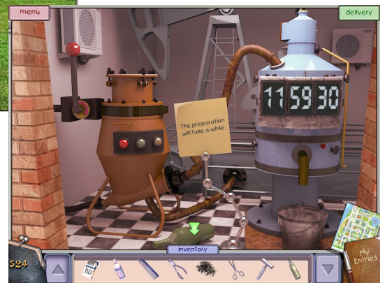
Produce oil and moonshine